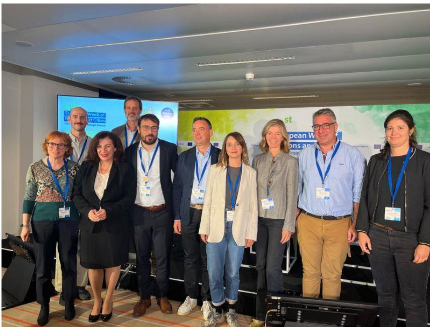
Fig. 3 – EWRC Session “Achieving Climate Neutral Cities through the Regeneration of Historic Urban Areas” (top). Group Photo from speakers’ session (bottom) ,