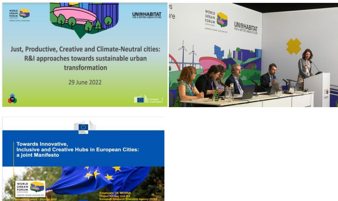
Fig. 2 - Joint networking session “Just, Productive, Creative and Climate-Neutral cities: R&I approaches towards sustainable urban transformation” (top) and for the Manifesto’s presentation (bottom), 11th World Urban Forum, June 2022.

These events played a significant role in strengthening cross-project collaboration and aligning strategic outcomes.